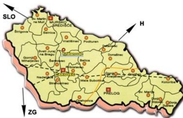
Fig.1. Position of Međimurje

Međimurje County is the northernmost county of Croatia bordering on two EU member states – Hungary and Slovenia. In the context of the Croatian accession to EU and favoring cross-border cooperation Međimurje County represents the northern gates of Croatia to the European Union, but also a link of the EU with other countries of South Eastern Europe. The geotrafical position of Međimurje has gained in importance after the construction of highway A4. This highway connects the continental states of Central Europe with our ports, and passes through the European corridor Vb. European road routes E-71 (Budapest - Goričan - Zagreb - Split - Dubrovnik) and E-65 (Budapest - Goričan - Zagreb - Rijeka) pass along this corridor. A modern highway allows a fast and efficient connection for the Međimurje population primarily towards Zagreb, especially for daily economic migrants.