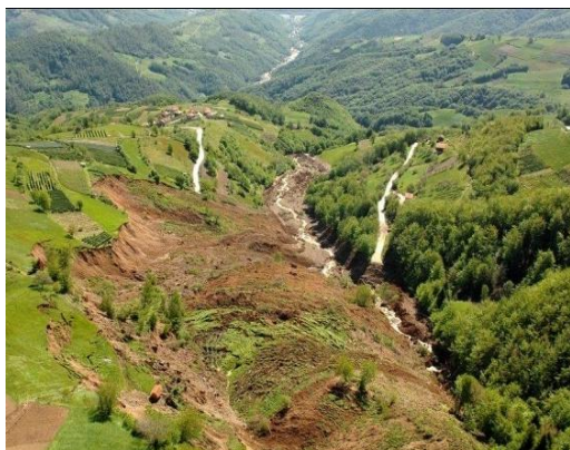
Fig. 6. Landslide initiated with the road communication in Željezno Polje.

Stream processes significantly modified the fluvial forms which moved directions of surface streams. Besides that, the significant changes in morphology of stream beds were conditioned by erosion and accumulation processes and phenomena. Besides typical fluvial processes, intensified proluvial, colluvial and alluvial processes induced denudation and the significant changes in morphology of stream beds. New fluvial processes caused the transformation of existing and initiation of new downhill forms. The existing stream beds and bottomland slopes in hydrographic system of the river Željeznica were modified so that at the ends of the bottomland slopes there