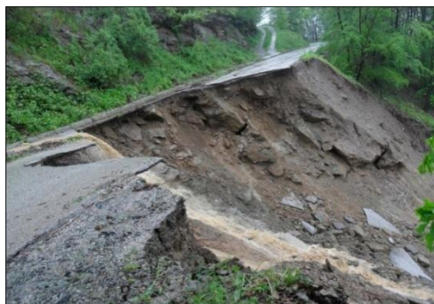
Fig. 3. The landslide initiated by cutting the unstable colluvial slopes in the Željezno Polje

Changes in the level of morphological compatibility of fluvial thalweg caused by construction of waste dam are also considered to be anthropogenic initiating factors since regressive erosion and fluvial alluvium accumulation are coordinated according to the dams. They actually represent a new erosion base according to which new fluvial thalweg moves. Upstream, the fluvial alluvium accumulates, while downstream the deep erosion is forming and causing riverbed to move according to the end erosion base of the water course termination point.