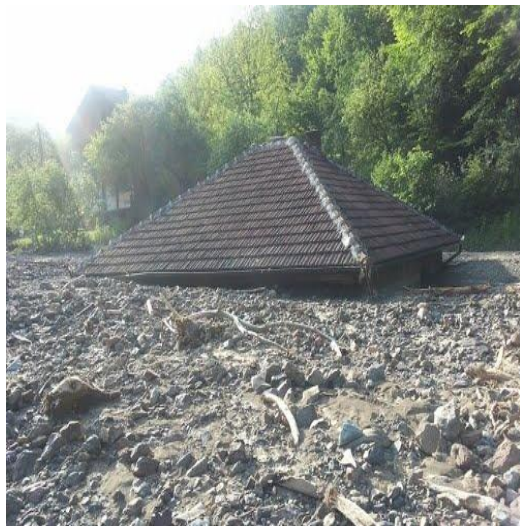
Fig. 4. Geohazard in the Željezno Polje in which during only one day, the accumulative fluvial deposits on the pediments raised erosional base for 10m, according to which the recent harmonization is accomplished.

transformations occurred in the rural areas where the number of residential and other buildings was continuously increasing from the number of eighty in the year 1930 to the number of 1221 nowadays.