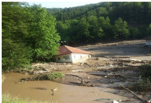
Fig. 5. Geohazard in the Željezno Polje, which accumulating the deposits raised the pediment in only few hours on account of lowering the existing morphological antiforms.

in medial than in transversal part accelerated the stream of the water in stream bed. All those factors caused intensive streaming of river tributaries. That was more evident in the basins with scarce phyto production such as the basin of the river Bosnia.