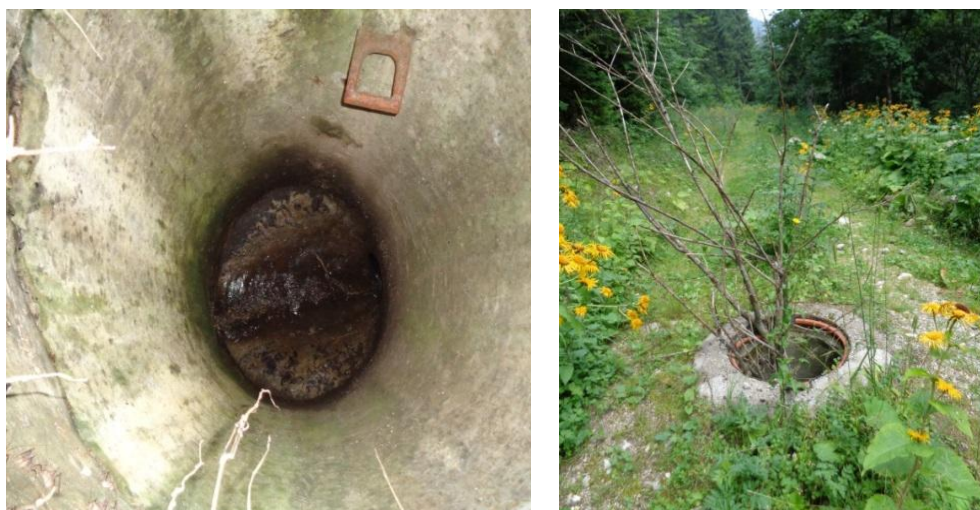
Fig 3. Derelict sewage network on Igman site Brezovaca, where a direct link through karst underground towards springs of Bosnia River is established. Clogged sewer pipe with mechanical waste (left) and manhole-sewer pipes without cover (image right).

Diseases, to which are persons who swim in such polluted rivers exposed or persons who use these rivers for recreational purposes are originating from pathogen microorganisms that originate from waste water and sewage. The most common causes are diseases from coliform bacteria, Escherichia coli , Streptococcus faecalis , although the cause may be also the other pathogenic bacteria as well, and also viruses and parasites. The presence of these bacteria in the water is concerning because they're not affected by the reagents used to purify water before its use.