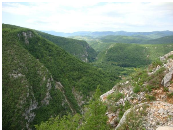
Fig. 5. Una valley with Unac. The Una valley is a border river with unique calcareous sinter cascades. It belongs to the tourist cross border zone.

The tourist zone represents a tourist profile - a belt of a large geographical region or a whole country. Within the tourist zone, there is almost no nonturistic content. It is a tourist recreational area with a high interregional and international significance. The tourist zone has a multitude of tourist contents for various aspects of tourist visit.