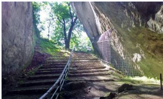
Fig. 1. The Djevojačka cave near Kladanj is not only a speleological site but also a tourist location of pilgrimage

near Stolac, the remains of the rustic villa Mogorjelo near Čapljina, the remains of fortresses in Daorson, Ošanići etc.