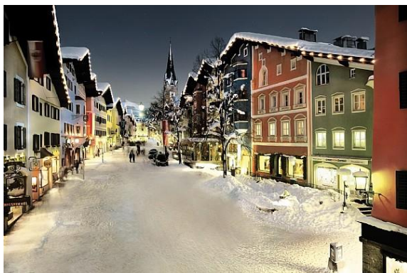
Fig. 4. Kitzbühel, a tourist place in the Tyrolean Alps with only 10,000 inhabitants. At the time of the famed downhill, the number of residents is tenfold.

The tourist center is formed within the framework of basic or primary tourist motives and encompasses several tourist sites. It represents a larger city with numerous tourist contents or specialized tourist and recreational objects of world importance, which touristically develops thanks to a multitude of diversified natural and social tourist elements. The world's tourist centers include old big cities such as Edinburgh, Hamburg, Amsterdam, Prague, Moscow, Paris, London and others. These include the urban sites that have reputation as a world tourist centers only at times of events such as film festivals in Cannes, Berlin, Hollywood, Pula, Sarajevo etc. The world manifestations can have a periodic character as those at the time of a summer or winter Olympic Games. In this way, the existing tourism or newly established centers become the center of the world based on certain tourist motives.