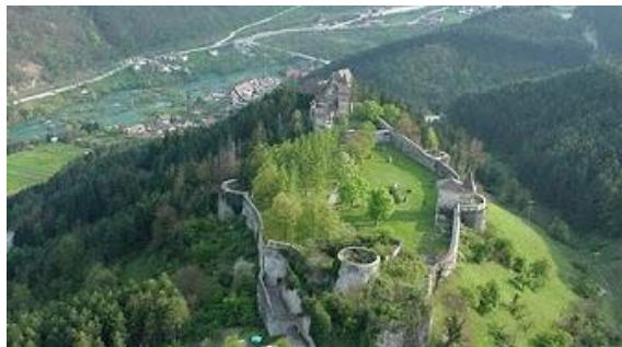
Fig. 2. Medieval fortified town Ostrožac with the homonymous substructure where the hotel is located, which is a tourist site and potentially a tourist place for the development of transit tourism

For example, the city of Jajce is an ideal example according to historical elements or Počitelj according to its oriental culture and the development of civilization events. The