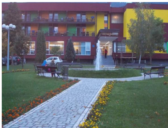
Fig. 3. Aquaterm in Olovo is tourist site of health-recreational tourism

presentations, tourist signs and tourist accommodation facilities will be bypassed on any tourist corridor. As an example of an unused tourist resort is the old town of Ostrožac with the tower in the valley of Una near Cazin. It is famous because of the fort from the older iron age with a medieval tower dated in 1286. when the settlement is mentioned as a town of