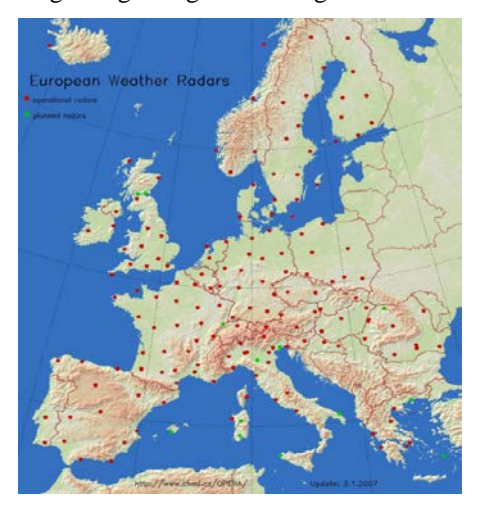
Fig. 1. Geographical distribution of meteorological radar service in European Union member states

On the basis of the alarming water levels height on the river system mapping is performed and based on the development of the meteorological situation trend of further development of the water level is estimated. Mapping monitorin current water level and the tendency of future development is with isolynes plotted on a topographic map of large scale or regional planning basis. Based on maps and plans we calculate the area affected by floods. In this way, define objects that need protection of the embankments, as well as their height regarding meteorological conditions.