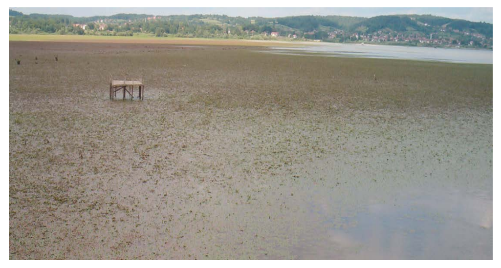
Fig. 4. Wrong forecast of isohyets regimes during the cold period of the year when large amounts of water were released from the lake Modrac, so (in the same period), winter rainfall brought by tributaries Spreča and Turija could be accumulated, which prolonged dry season in summer which caused a decrease in the area lake for 1/3. This had negative impact on summer-tourism season.

The indirect measures and activities for the protection of flood waves include population education about the proper zoning measures of water protection zones. Thus once the owner - builder realizes useless investment in construction of buildings, to which he must be indicated by the institutions that issue building permits, they will soon give up the original idea.