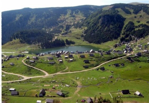
Fig. 2. Prokosko Lake – recent state

The first geological study of the mountain Vranica which mentions, among others, the Prokosko Lake, comes from F. Katzer (1902) in the form of extensive work named Paleozoic of Vranica.