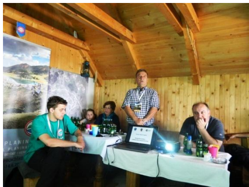
Fig .1. Opening speeches at scientific event about Prokosko Lake

A scientific event was held during the days of mountaineering in Federation of Bosnia and Herzegovina, as a part of Festival of mountaineering, on 13 June 2015 at the Prokosko Lake site, Vranica Mountain. This event was attended by the naturalists, who presented current issues related to the recent state of the natural aqual complex in direct and indirect basin of the Prokosko Lake with hints of negative trends of natural evolution and negative anthropogenic interventions that accelerate the natural evolution with the proposal of prognostic measures and elimination activities of negative tendencies in the future development.