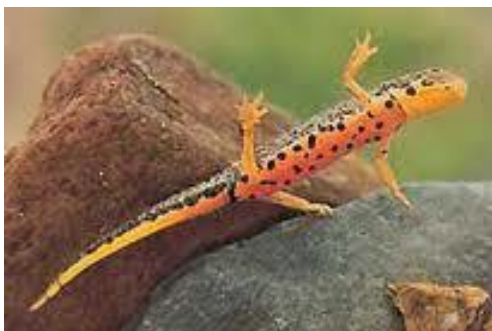
Fig. 4. Triturus alpestris reiseri

Such evolution of the Prokosko Lake is confirmed by the past and present of Suho jezero, located near the borders of the accumulation wall, on the northwest side of the Prokosko Lake. Suho Lake doesn't have lacustrine function and through paleolimnic valley flows a steady stream.