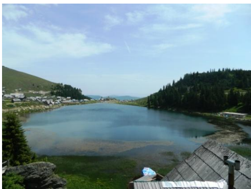
Fig. 6. Prokosko Lake today. Artificial intervention in the riverbed of the lake's river, without legislative approval, raised the level of the lake, which will have unforeseeable negative consequences for its further development.

Usurpation of the direct drainage basin of Prokosko Lake directly affected the modification of its natural state. From the group of negative tendencies, harmful, especially to the lake water is the production of organic sludge and waste from pens, barns livestock cottages and weekend-houses. The organic sludge and other sewage, which are the parts of incoming water in the lake, are deposited in the lake and stir the lake's water because of which it is opaque, and colloidal particles fall to the bottom of the lake, where they rott. The decaying process consumes a large amount of oxygen from the water, which is conducive to the coastal eutrophication of the lake.