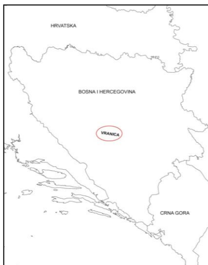
Fig.1. Geographical position of Vranica and Bosnie and Herzegovine

Mountain area of Vranica is located in the central part of Bosnia and Herzegovina, which positionally determines it in the transition zone between the southern parts of the northern climate belt and northern parts of the subtropical belt. Group Vranica (F. Katzer, 1902) is the central Palaeozoic core, with total or partial development of Carbon, Silurian and Devonian geological formations in which, in addition to Vranica belong: Bitovnja, Pogrelica, Zec-planina, Dobruška i Krušička mountain. Morphostructural core of Vranica