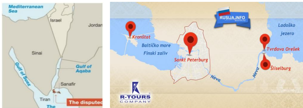
Fig. 6. Aqaba bay with length of 160 km, and width of cca 24 km, city of Eilat (Israel) got exit to the open sea(image left) and Position of Sankt Petesburg to the open sea between finland and Estonia.

Sea was applied in recent arbitration over the Bay of Piran whose stakeholders were R. Slovenia and R. Croatia in favor of R. Slovenia .