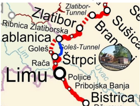
Fig. 3. Segment of railway Beograd – Bar in Bosnia and Herzegovina in the place of Štrpci. Source https://www.google.ba/search?source= granice BiH Srbija

The problem of the eastern border of Bosnia and Herzegovina was registered in the municipality of Rudo and cross-border in Priboj on the side of R. Serbia. In order to reach the settlement of Sjeverin and others, which territorially belong to Bosnia and Herzegovina, one should pass several kilometers through R. Serbia. It is an enclave that is completely surrounded by the territory of the Republic of Serbia; similar to some small states in the world that are surrounded by the territory of a state. Citizens of this settlement exercise their rights to work and education of children in Rudo. On the same territory in the village Međurječje border between the Republic of Serbia and Bosnia and Herzegovina was withdrawn in mid of cemetery, and locals, although belonging to the territory of Bosnia and Herzegovina pay the electricity bill to Republic of Serbia.