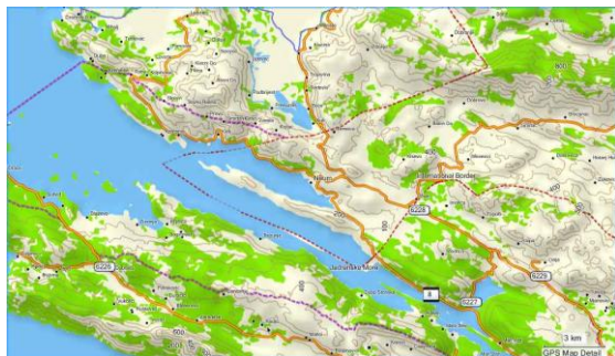
Fig. 7. The promised border at sea by the President of Republic of Croatia Franjo Tuđman and a member of the presidency of Bosnia and Herzegovina Alija Izetbegović closes the lines of Bosnia and Herzegovina on the open sea. In the upper left corner of the picture, the red line is a direction for the construction of the Peljesac Bridge, which would permanently disable the open sea exit.

- It would influence the visual degradation of the tourist purpose of Neum and its associated coastline.