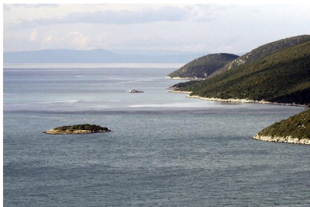
Fig. 5. Great and Small školj in the Mali Ston channel

Bosnia and Herzegovina lays the right to the inland sea and in the channel of Mali Ston between the peninsula Klek and Peljesac. In the Maloston Channel along the Klek shore there are two smaller islands (skoljs) Mali and Veliki, above which Bosnia and Herzegovina has sovereignty. The large skolj of 7.6 dunums is located along the southeast coast of the peninsula Klek at a distance of 175 m from the coast. The big skolj is the most protruding part of the land in the aquatorial part of the territory of Bosnia and Herzegovina. Mali Školj is located near the coast with an area of 820 m 2 , and is 2.1 km away from the Great Skolj.