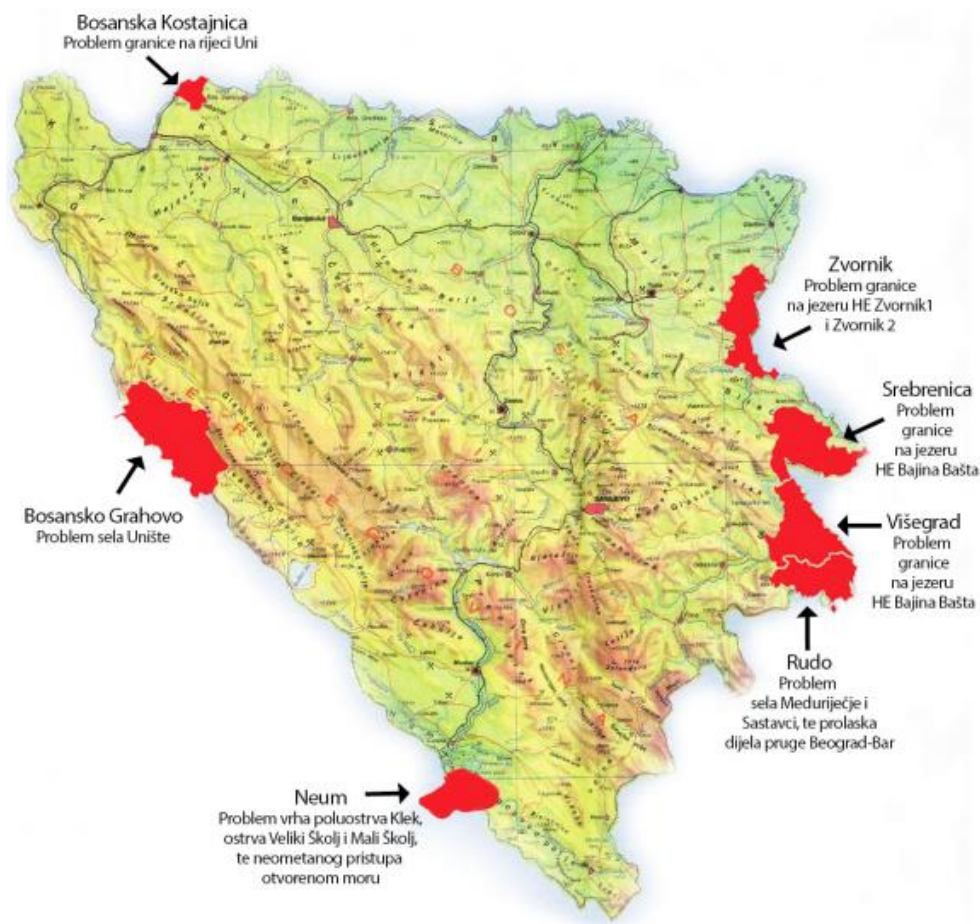
Fig. 2. Problematic boundaries of bosnia and Herzegovina and its neighbours

natural meandering was also triggered by anthropogenic interactions, the most frequent ones being the exploitation of gravel river deposits on the concave sides of the meander. Lateral and regressive processes in the river bed of the Drina significantly affected the morphology of the riverbed, which is on some parts of the longitudinal profile modified into starace and cut off meanders. With these potamological processes, only 400 hectares of fertile soil remained on the territory village Janja in the Republic of Serbia. Their processing by the owners from Bosnia and Herzegovina had come into question because of the border crossing, from which the closest one was few tens on kilometers away. This and such controversial border issues are in the domain of compromise inter-state dispute.