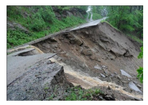
Fig. 3.The landslide initiated by cutting the unstable colluvial slopes in the Željezno Polje

Changes in the level of morphological compatibility of fluvial thalweg caused by construction of waste dam are also considered to be anthropogenic initiating factors since regressive erosion and fluvial alluvium accumulation are coordinated according to the dams. They actually represent a new erosion base according to which new fluvial thalweg moves. Upstream, the fluvial alluvium accumulates, while downstream the deep erosion is forming and causing riverbed to move according to the end erosion base of the water course termination point.