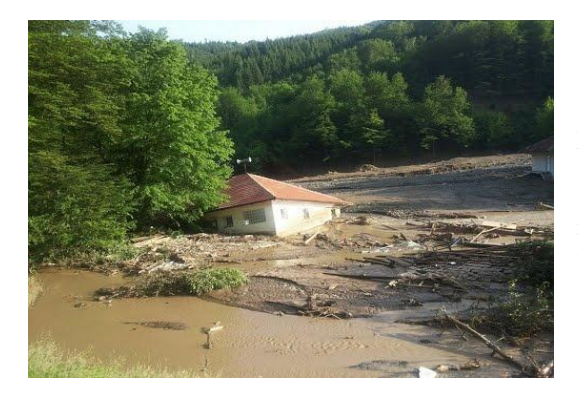
Fig. 5. Geohazard in the Željezno Polje, which accumulating the deposits raised the pediment in only few hours on account of lowering the existing morphological antiforms.

The transformations of the rural areas together with other infrastructure induced splitting of Paleozoic molasse pediments on smaller parts which significantly changed morphologic evolution. Joint with agrarian processes, the processes substituted natural forest landscapes with anthropogenic ones which could not resist latest fluvial hazards. Severe weather with enormously high five-day quantity of rainfall caused increased inflows to the river streams.