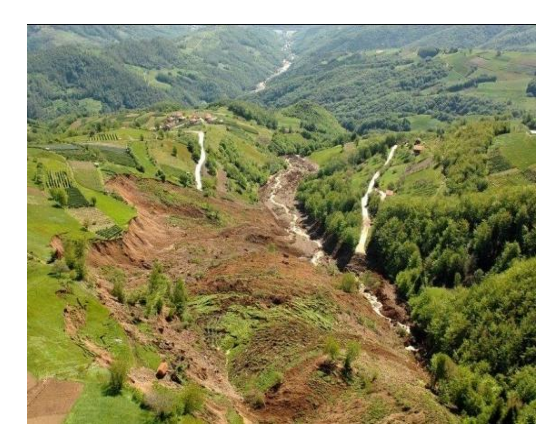
Fig. 6. Landslide initiated with the road communication in Željezno Polje.

Stream processes significantly modified the fluvial forms which moved directions of surface streams. Besides that, the significant changes in morphology of stream beds were conditioned by erosion and accumulation processes and phenomena. Besides typical fluvial processes, intensified proluvial, colluvial and alluvial processes induced denudation and the significant changes in morphology of stream beds. New fluvial processes caused the transformation of existing and initiation of new downhill forms. The existing stream beds and bottomland slopes in hydrographic system of the river Željeznica were modified so that at the ends of the bottomland slopes there