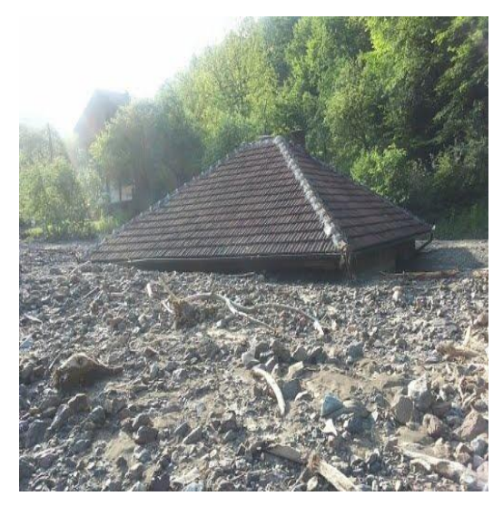
Fig. 4. Geohazard in the Željezno Polje in which during only one day, the accumulative fluvial deposits on the pediments raised erosional base for 10m, according to which the recent harmonization is accomplished.

transformations occurred in the rural areas where the number of residential and other buildings was continuously increasing from the number of eighty in the year 1930 to the number of 1221 nowadays.